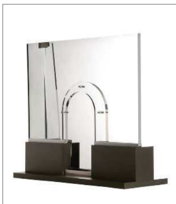
ARCHED WINDOW DESIGN