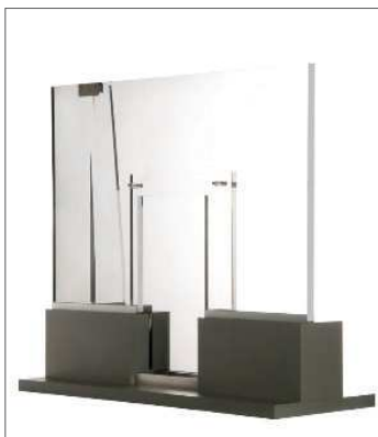
SQUARE TOP DESIGN